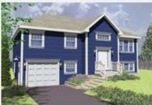
Nova Scotia homes have appeal to foreign buyers from the U.S., Germany and elsewhere

As a foreign resident from the United States or Germany or anywhere for that matter, as you consider the purchase of land or homes in Canada or specifically Nova Scotia, following are some helpful guidelines to consider: